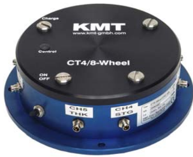
with internal Tx-antenna only for 40kbit