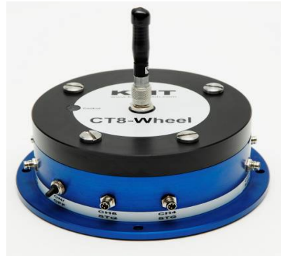
with internal Tx antenna recommend >320.....1280kbit