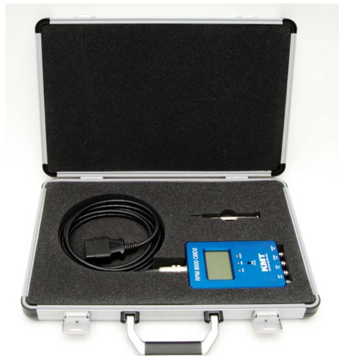
RPM8000OBDD2 – in transport case